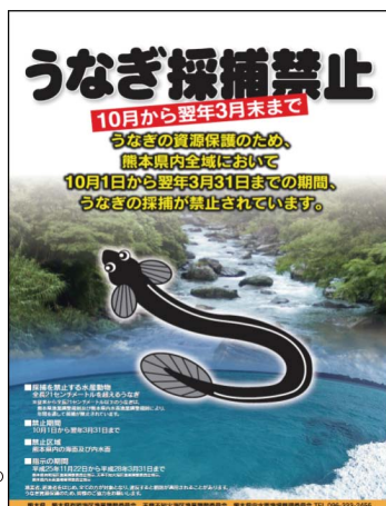
A poster made by Kumamoto prefecture to save the eel resources

In order to secure that more adult eels migrate to the spawning ground in the sea, eel fishing in the migrating season (October-December) is prohibited in many fishing grounds.