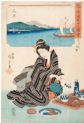
"No.32 Arai, Kabayaki, the local specialty: from Tokaido Gojusan-tsugi, (53 stages on the Tokai-do Road)" By Hiroshige UTAGAWA 1847-1852