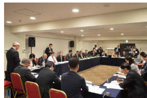
ASEA The First Meeting (in June 2015)

Governments and industry keep their cooperation to promote the sustainable use of eels to preserve the Japanese food culture.